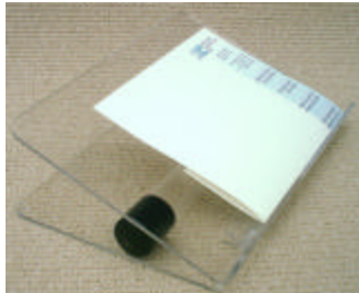
CODE : EDHCH1000