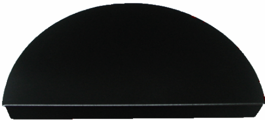
CODE : EINT916 (BLACK)