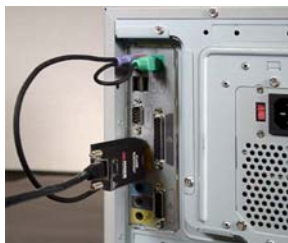
Direct connect CAT5 Transmitter streamlines your installation

As the inventors of the KVM switch, Rose continues to provide leading solutions for your server management needs. With headquarters in the US and offices in Europe and Asia, Rose provides a full range of capabilities and support. Call us today for more information about this and other Rose